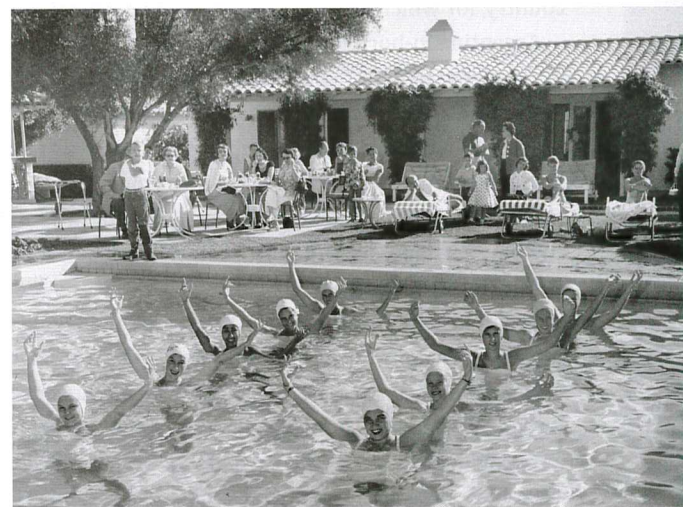
ABOVE: An aquacade for fun and exercise at Howard Manor long before anyone heard of synchronized swimming.