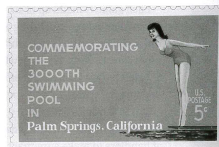
RIGHT: Palm Springs' 3000th swimming pool commemorative stamp.