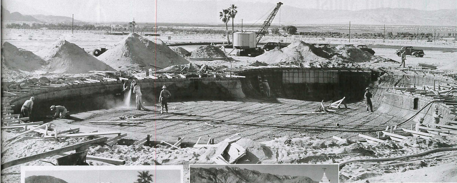
TOP: Still in use today, the expansive pool of the Shadow Mountain Club is under construction.